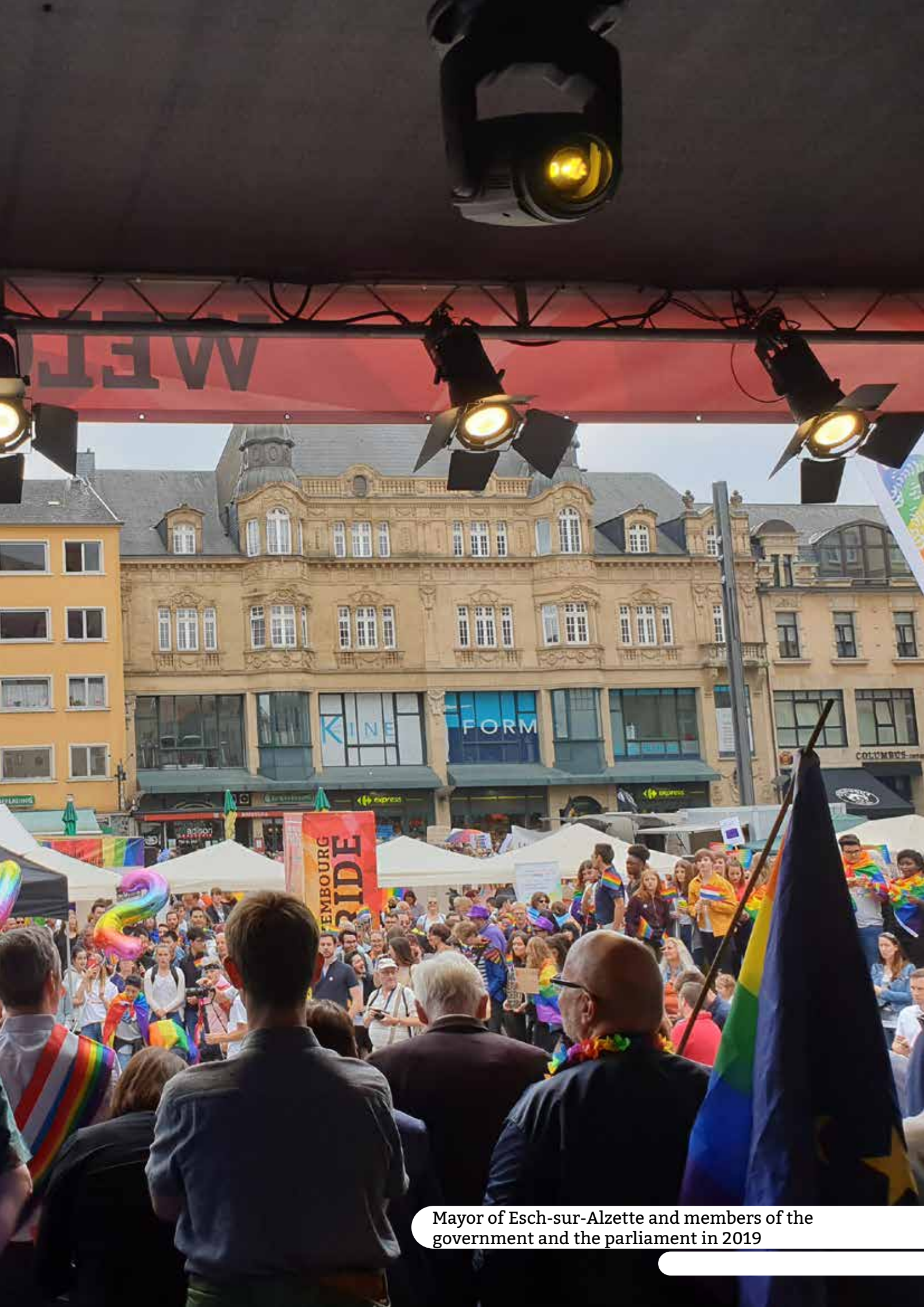
Mayor of Esch-sur-Alzette and members of the government and the parliament in 2019