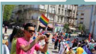
2016 GayMat: new milestone in terms of visitors 5000 visitors during the whole Pride Week