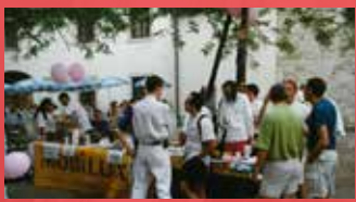
1999 First GayMat as an information stand at the "Place du Théâtre" in Luxembourg City.