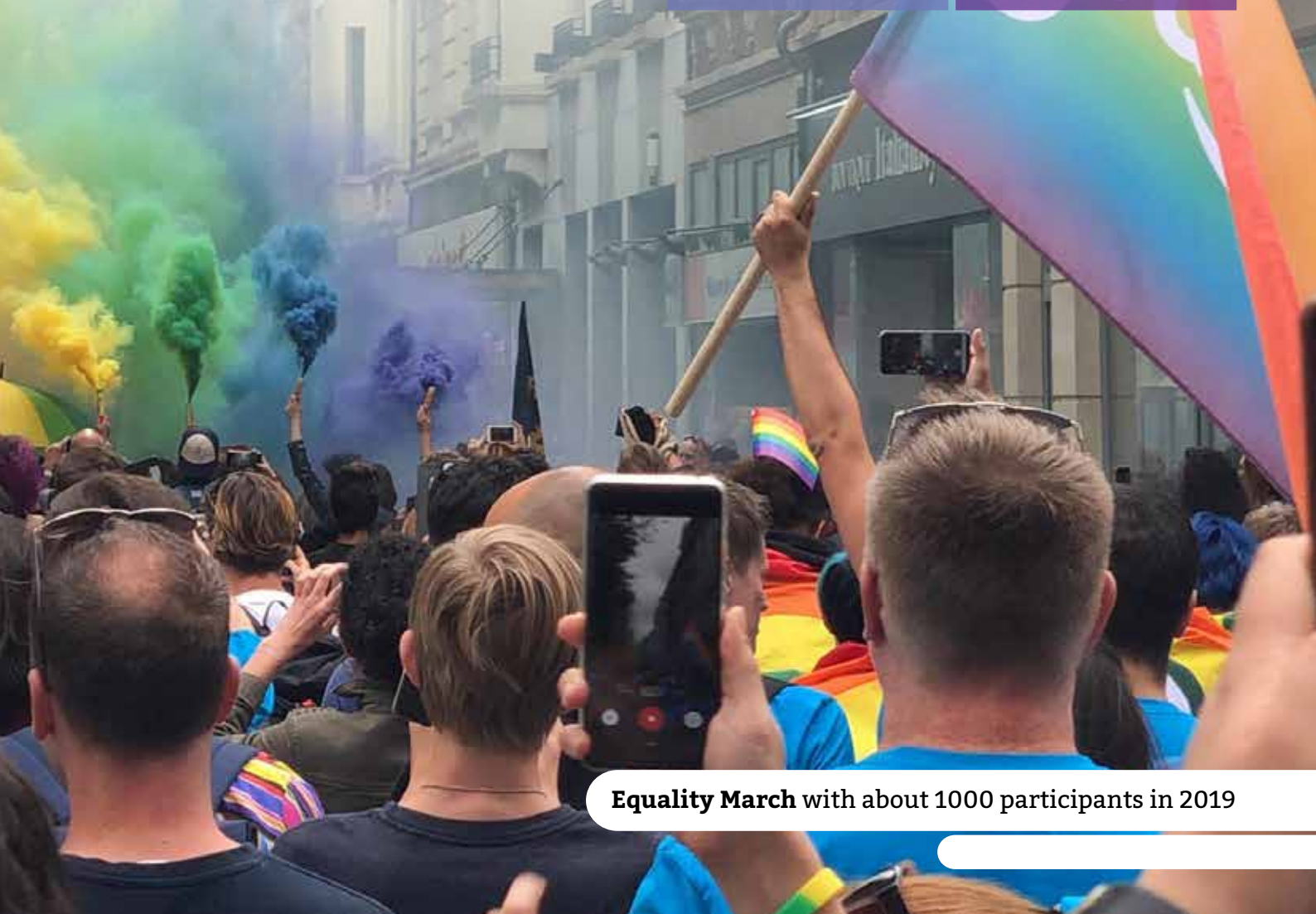
Equality March with about 1000 participants in 2019