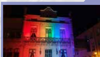
2019 20 Years of Pride in Luxembourg 6000 visitors during the whole Pride Weekend. For a first time a street fest on saturday and sunday and participation of 8 ambassadors and the prime minister in the Equality March. Creation of a LGBTQ/Pride Tourism Strategy. The event will be renamed "Luxembourg Pride" for the anniversary.