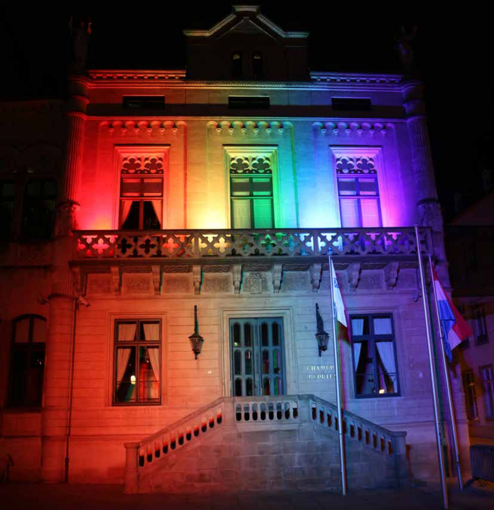
Chambre des députés during Pride Week 2018 & 2019